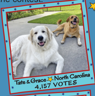
Tate & Grace ★ North Carolina 4,157 VOTES