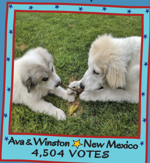
Ava & Winston ★ New Mexico 4,504 VOTES