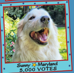
Sunny ★ Maryland 3,000 VOTES