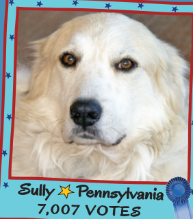
Sully ★ Pennsylvania 7,007 VOTES