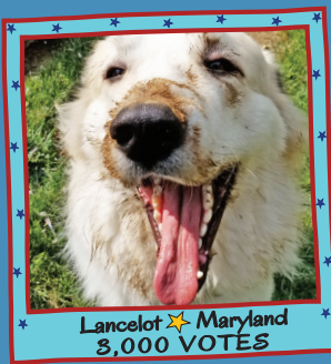
Lancelot ★ Maryland 3,000 VOTES